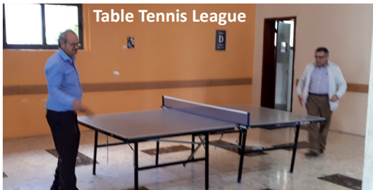
Table Tennis League