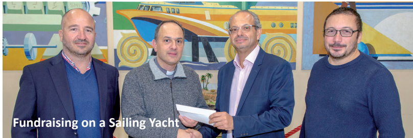
Fundraising on a Sailing Yacht