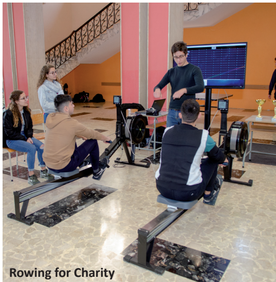
Rowing for Charity