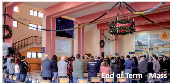
End of Term - Mass