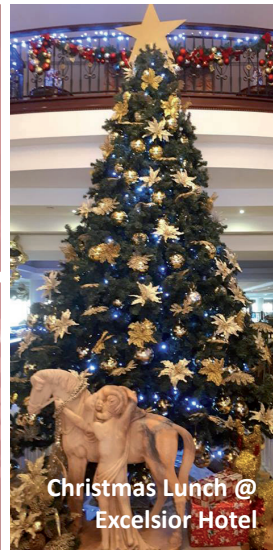
Christmas Lunch @ Excelsior Hotel