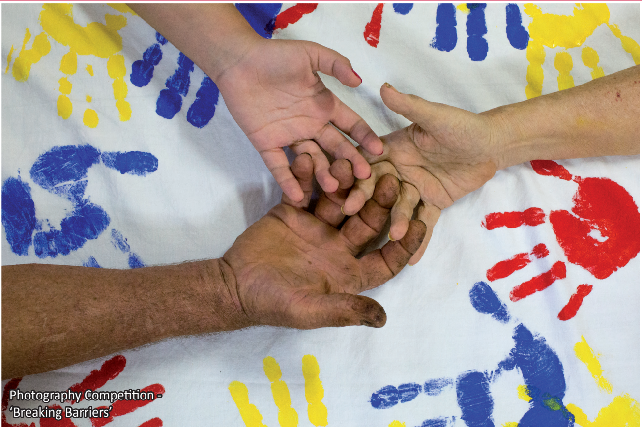
Photography Competition - 'Breaking Barriers'

In this photo, 'Breaking Barriers' is defined as 'to overcome differences (between or among groups)'. The hands chosen symbolize three groups in society; the teenagers (red), the elderly (yellow) and the dark-skinned (blue). The interlocking of the fingers show the collaboration between the groups thus breaking the social barrier. – Maria Vella