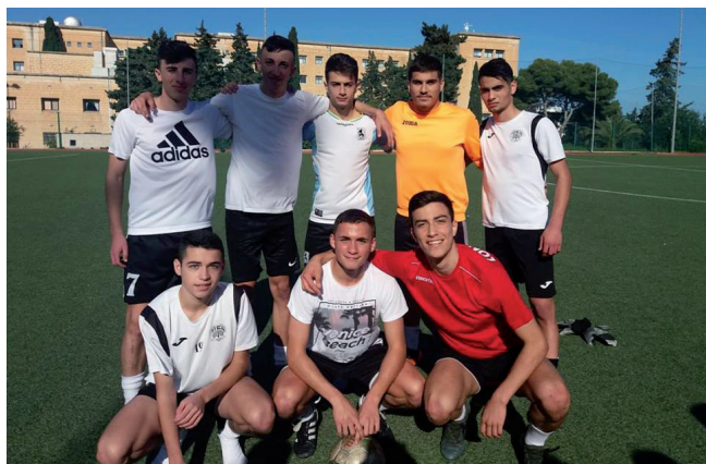
Winners of the football interschools (JC team)