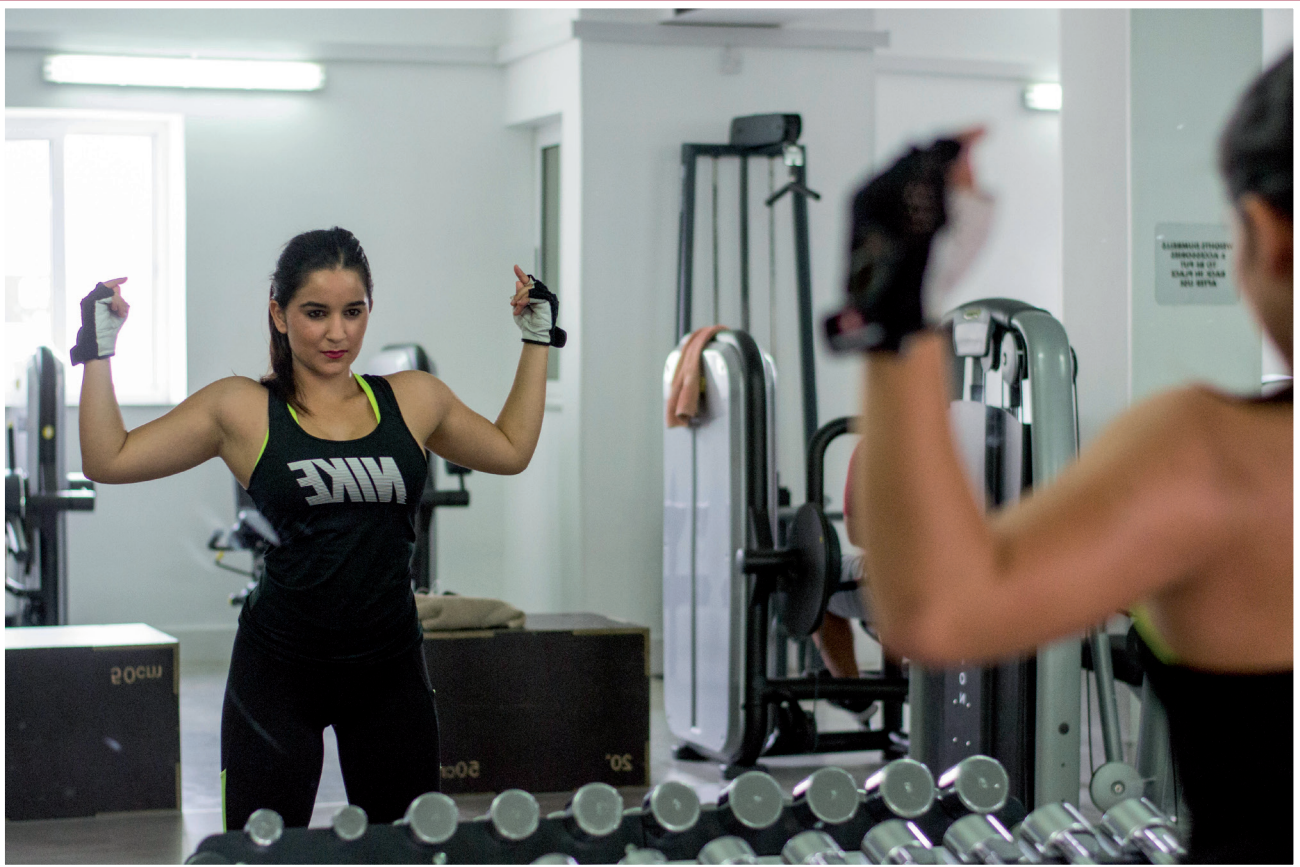
Photography Competition - 'Breaking Barriers'