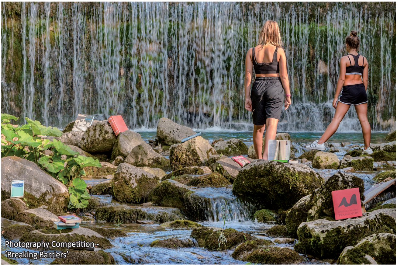
Photography Competition - 'Breaking Barriers'

'A bridge to know' – Culture allows us to build a solid bridge to overcome all those barriers that hinder learning and to discover what is hidden behind the wall – Fabrizio Martinuzzi